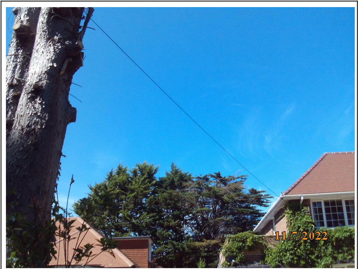
TPO 3 of 2022 16 Second Avenue Cypress of G1 from A27 Upper Shoreham Road

The Tree Preservation Order is to ensure that any further works can be controlled by the Local Planning Authority. It is considered in the interests of the local amenity that it is recommended that the TPO is confirmed.