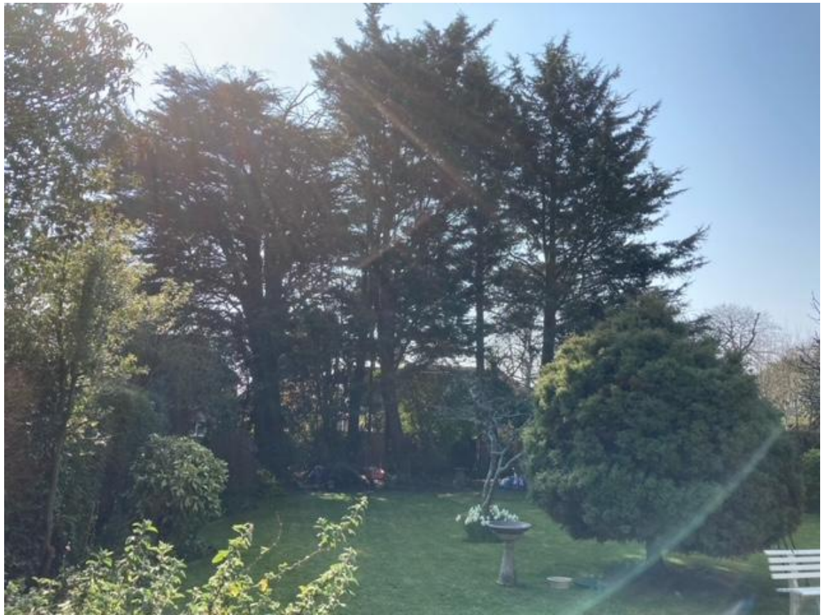
TPO 3 of 2022 16 Second Avenue Cypress G1 from NE

The Tree Preservation Order is therefore considered necessary to ensure that any future works can be considered and if needed amended by the Local Planning Authority. The representations refer to there being some defects, such as damage and dead hanging branches within the crown of the oldest tree on the eastern end of the group, and suggests that this tree is diseased. Although on inspection some dead branches were found to be present, there was no suggestion that the trees are unstable or diseased. It is also argued that the trees are not fully visible from the public road, and therefore not worthy of being protected. It is less common to place TPOs on trees in rear gardens, normally because they have less public views, however in this case the trees are visible between the properties from Second Avenue and from the Upper Brighton Road, where they provide a backdrop to the surrounding properties.